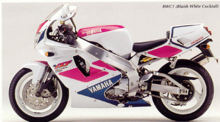
BWC1 (Bluish White Cocktail)