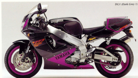
DG1 (Dark Grey 1)